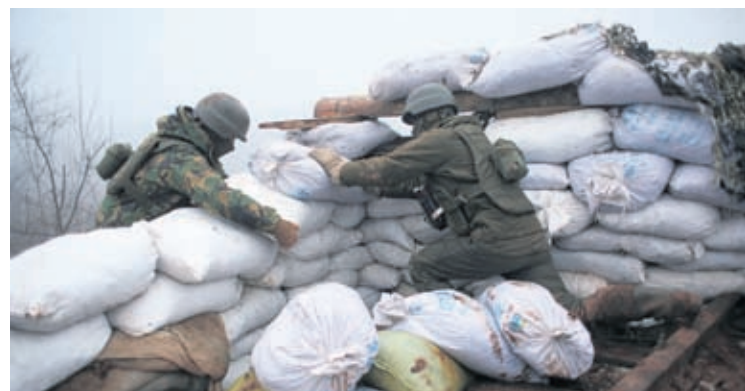
In this file photo dated Monday, Dec. 9, 2019, Ukrainian soldiers strengthen their front line position in the town of Novoluhanske in the Donetsk region, Ukraine.